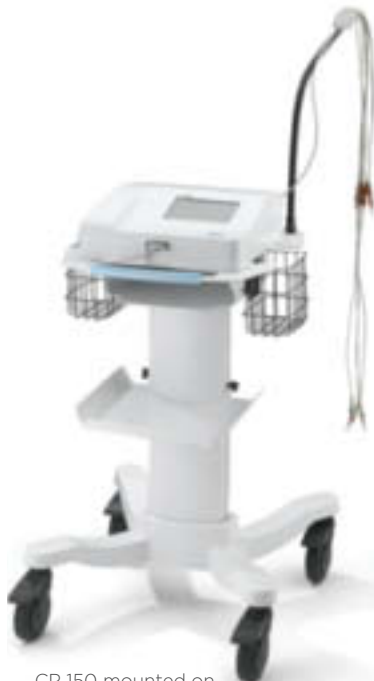
CP 150 mounted on hospital cart with cable arm and shelf