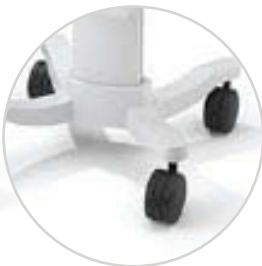
Office cart wheels